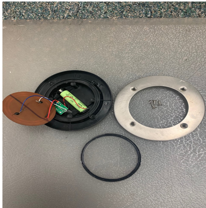
3. Remove Gasket and move Solar Panel without disconnecting or breaking any wires