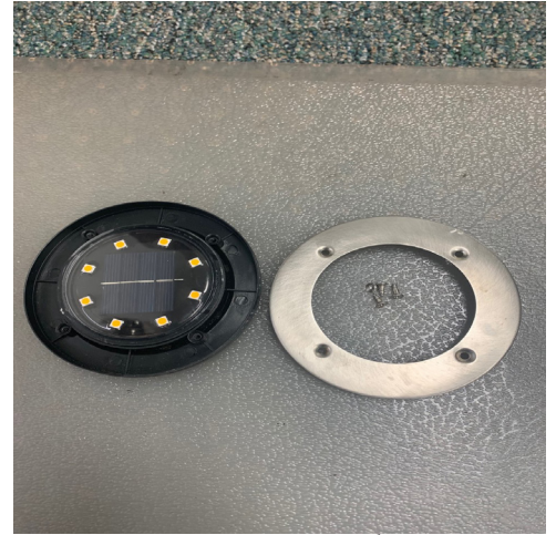
2. Remove Faceplate