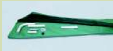
Optional Carrying Case