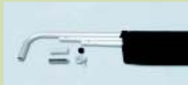
Pole Set with Economy Bag